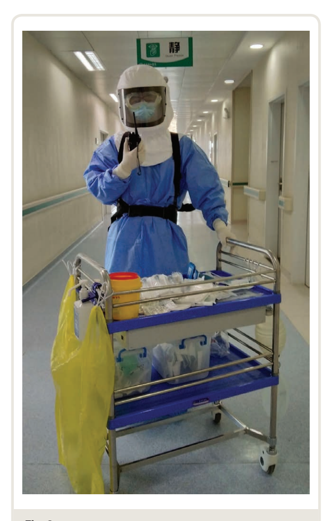
Fig. 3. Emergency intubation cart.