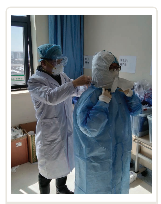
Fig. 2. Personal protective equipment self-check and inspection by another colleague.